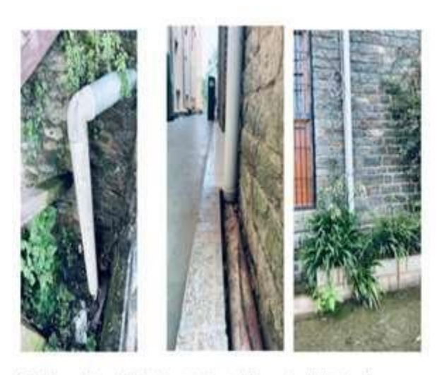
PVC pipes used to reach the rain water to the tank from various buildings'roof