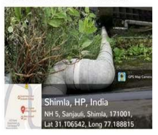
PVC pipes used to reach the rain water to the tank from various buildings roof